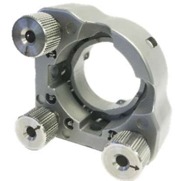
MHX-25.4F-R with optional knobs (sold separately)