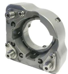
MHX-25.4F-R with optional locks (sold separately)