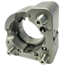
MHX-25.4F-R mount, rear view